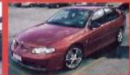
VY RB-Style Kit To Suit VT-VX Sedan