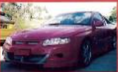
Maloo-Style Ute Kit