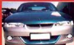
VT Conversion Kit To Suit VN-VS Sedan & Ute