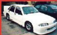
VL Walkinshaw Kit

Brand New Product - VY RB-Style Kit To Suit VT-VX Sedan