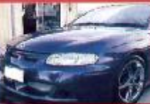
Monaro-Style Kit To Suit VT-VX Sedan