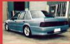
VL Aero Executive & Calais Kits