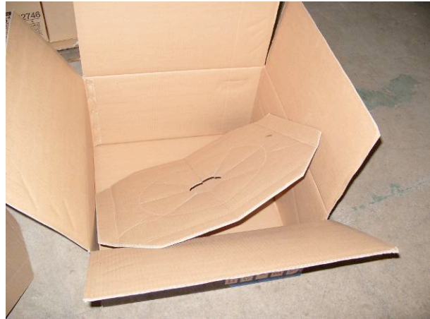
(8) PAPER BOARD IN BUTTOM-1