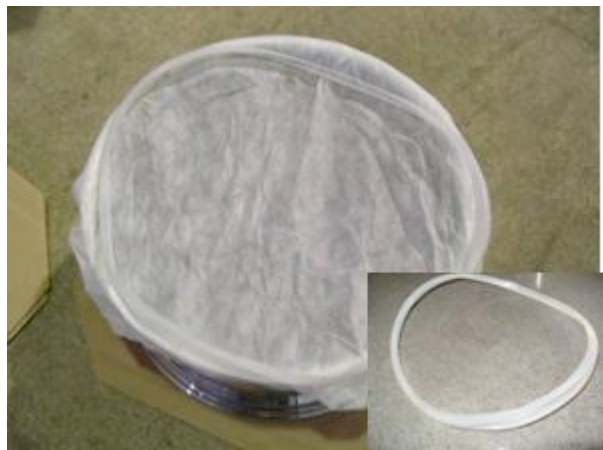
(6) PVC BAG -1