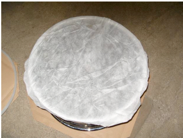
(5) TENSILE COVER +PVC RING