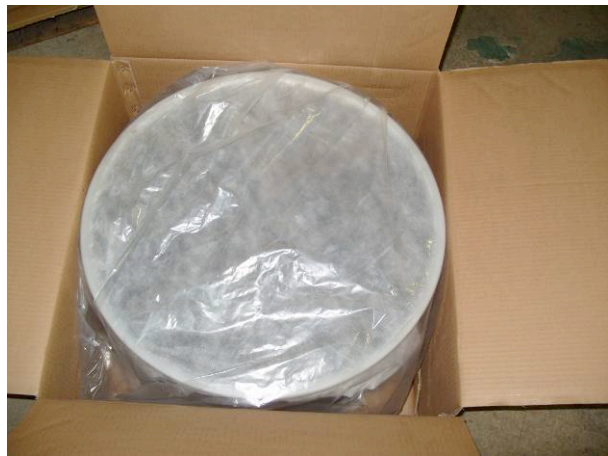
(10) PUT THE WHEEL IN BOX