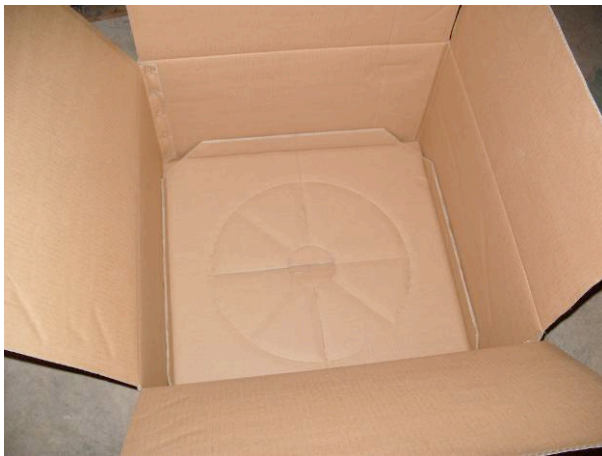
(9) PAPER BOARD IN BUTTOM-2