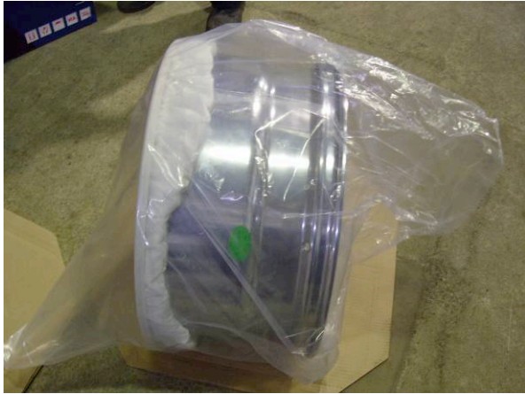
(7) PVC BAG -2